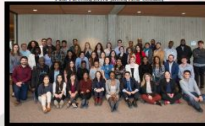
IINSPIRE LSAMP Annual Conference 2018-19' Attendees

The IINSPIRE-LSAMP Alumni Committee aims to unite post-baccalaureate IINSPIRE students in hopes to facilitate a successful undergraduate career for current students.