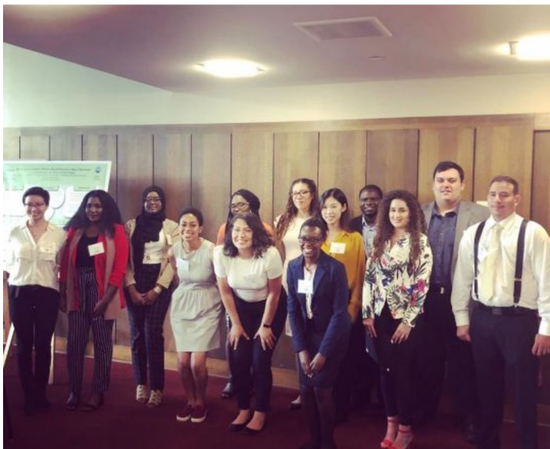
IINSPIRE LSAMP RISE UP Summer 2019 Undergraduate student researchers at the Iowa State University Summer Research Symposium

Join me in congratulating this year's IINSPIRE LSAMP and RISE UP summer research interns! The Research Innovation in Science Enrichment University Program (RISEUP) allows underrepresented, community college, STEM students to conduct research at ISU. It is a great first step into the world of research!